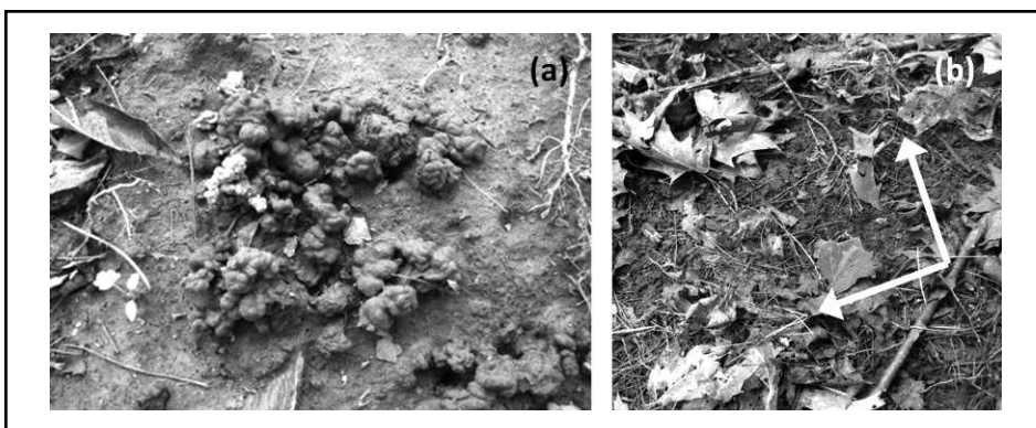
Figure 2. Earthworm casting material (a) and Lumbricus terrestris middens (b).

At Minnesota points, the forest floor was measured between 1 June–31 August 2009. Because the state parks span > 150 km from south to north and experience different timing of seasonal temperature and moisture patterns, parks were surveyed in a random order to avoid confounding effects of climate. We collected all data within a 5-m radius centered on each point. Fragmentation of the litter layer was classified into one of three categories that reflect increasing earthworm decomposition (1 – Intact, layered forest floor, O_i , O_e , and O_a horizons present; 2 – Litter layer partially fragmented, but with litter from > 1 yr; 3 – No intact litter, only freshly fallen leaves from the previous autumn). Earthworm activity was visually estimated using an earthworm casting index (1 –